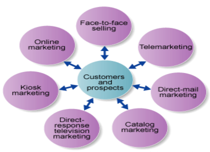
FIGURE 2 Forms of direct marketing